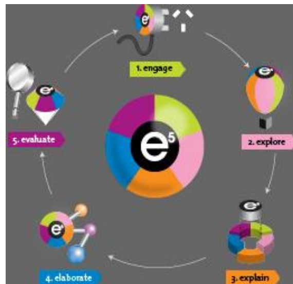
Appendix 3 E5 Instructional Model